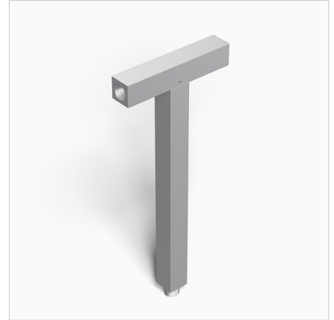
T-bar for Twin Head Mounting: ET-16-ACL