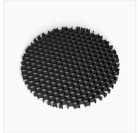
Hexcell Louver: LVR