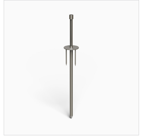
3 Prong Stake Ground Mount: MH01-BZ