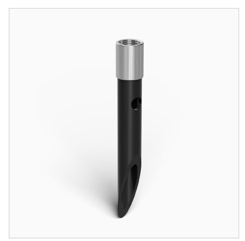
6" PVC Stake Ground Mount: MHCS-6