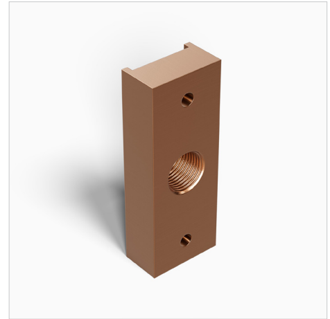
4" Pole Mounting Bracket: PMB-4-CC

Polyester powder coat with RoHS compliant procedures.