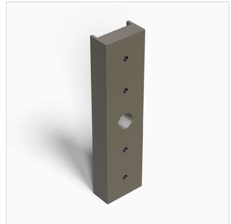
8" Pole Mounting Bracket: PMB-8-BZ